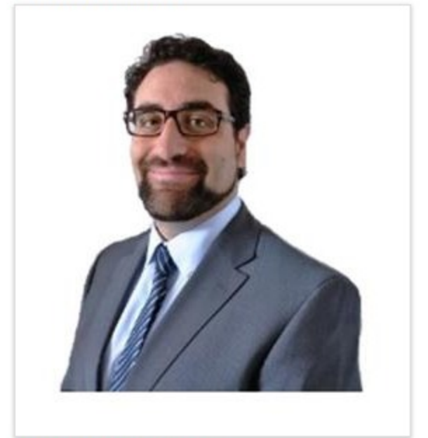
President of I-MED Pharma I-MED Pharma